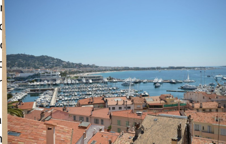
starting point for exploring the city and living an unforgettable Cannes experience.